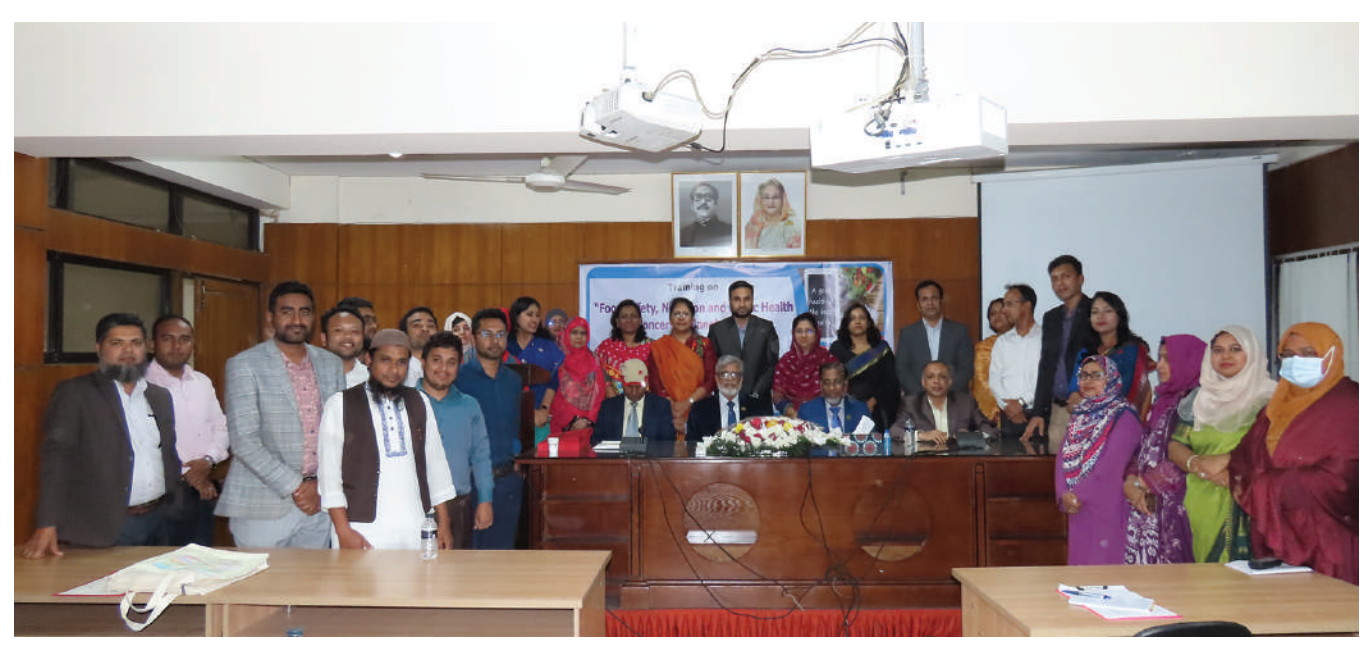
Group Photo of the Trainees with the Chief Guest

Food safety, nutrition, and public health issues are closely associated to ensure a safe and healthy life. In Bangladesh, to ensure food safety, issues are major challenges that persist at every level of the food chain from production consumption. In addition. unsafe food creates public health issues, hampers safe food supply, and reflects national economies, trade, sustainable tourism, and development. According to this apprehension, the Nutrition unit, BARC organized three-day long training program entitled Food Safety,