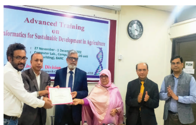
Training Program on Bioinformatics for Sustainable Development in Agriculture

Livestock Division, BARC organized a training program on Bioinformatics for Sustainable Development in Agriculture on 27 November to 01 December 2022 at BARC. In this training course, twenty officers from NARS institutes (BARI, BRRI, BSRI, BFRI,