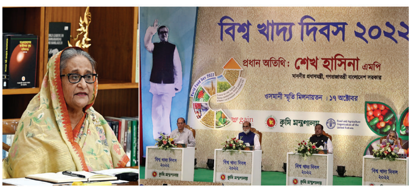
Hon'ble Prime Minister Sheikh Hasina Inaugurated the World Food Day 2022

World Food Day 2022 was observed on 17 October 2022 in Bangladesh taking various programs. The theme of the day was 'Leave no one behind: Better production, better nutrition, a better environment, and a better life.'